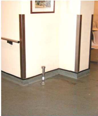
Corridor in front of lift